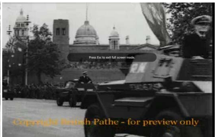
Daimler scout car F340675 with officer from The Royal Navy