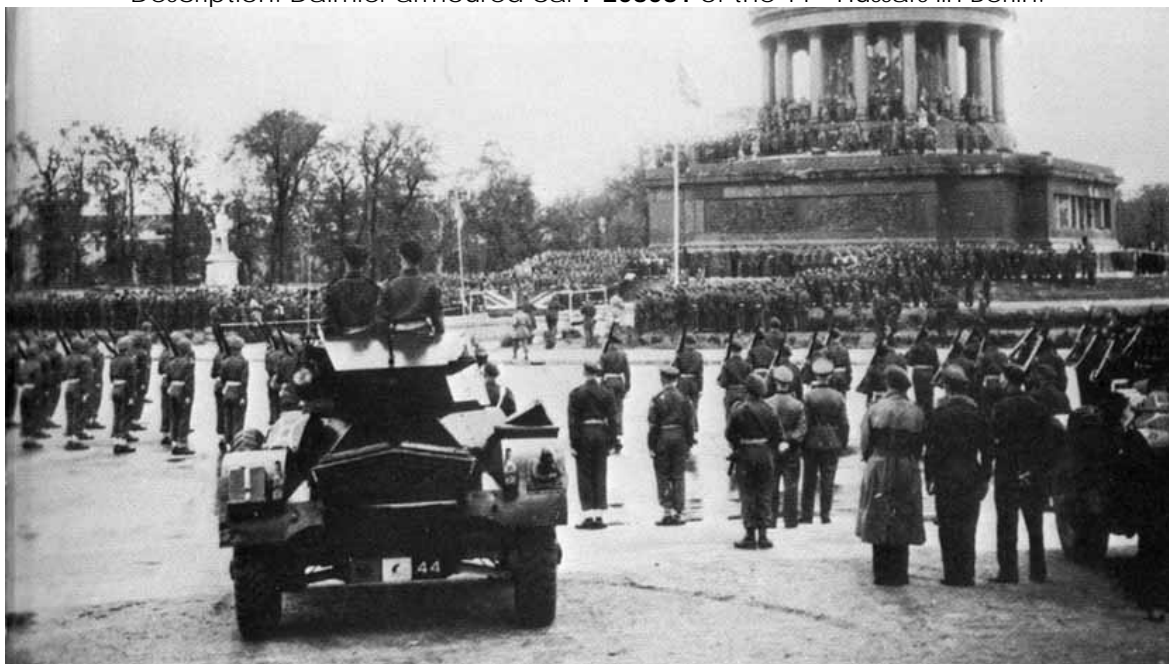
Description: DAC at the Berlin flagCeremony