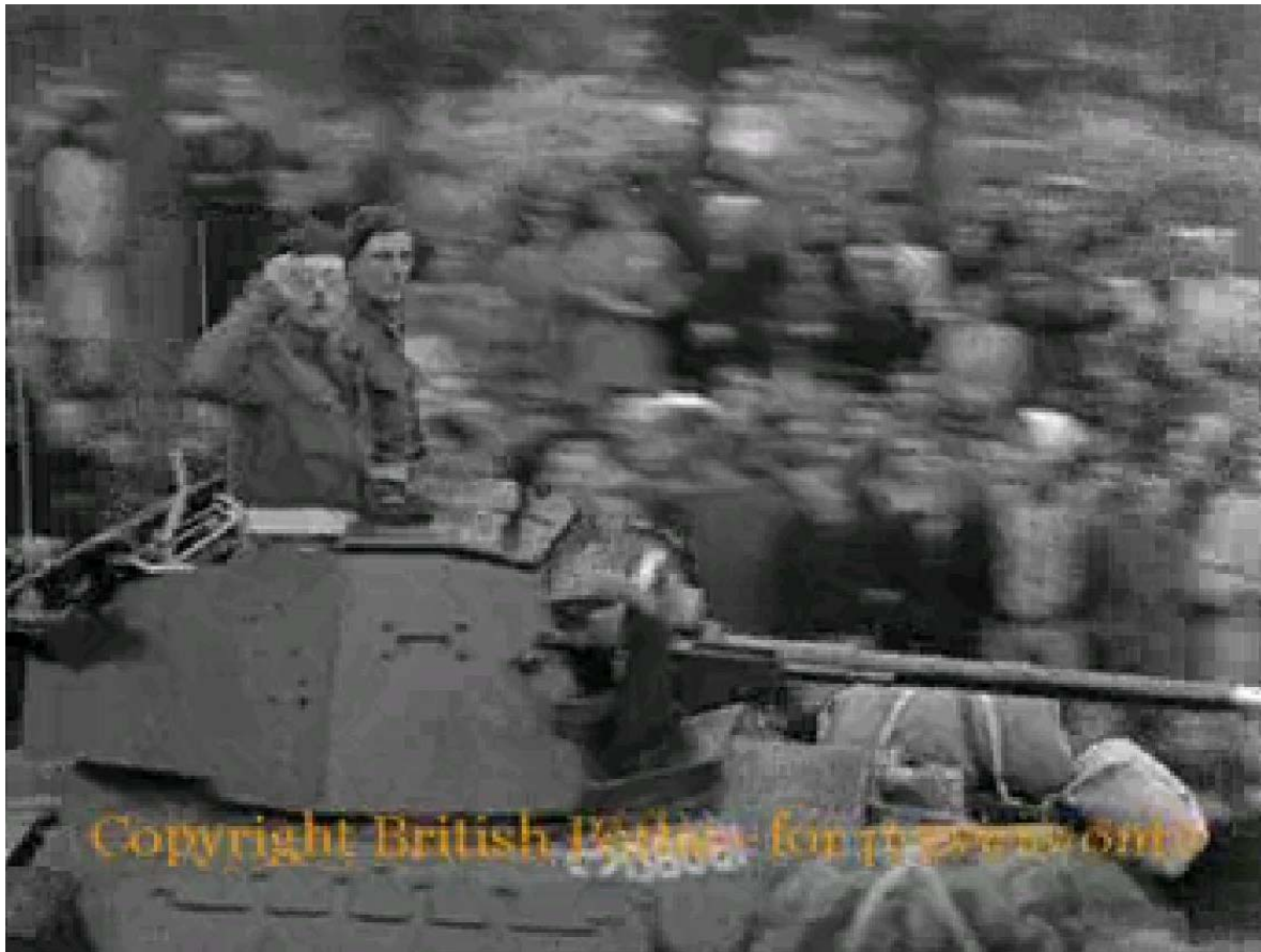
Description: Daimler armoured car F 208081 of the 11 th Hussars iin Berlin.