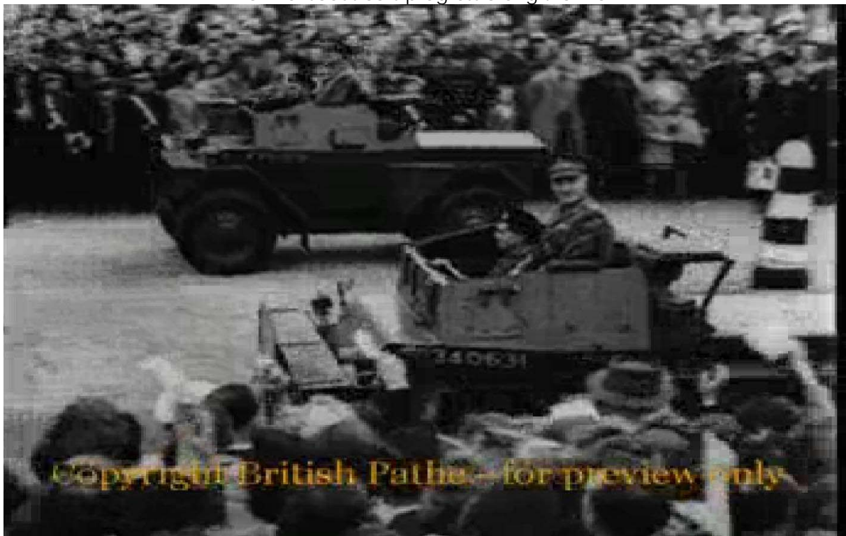
Daimler scout car F340631