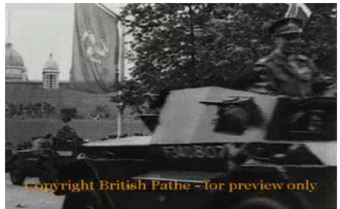
Daimler scout car F340807 with officer from First or Second army group