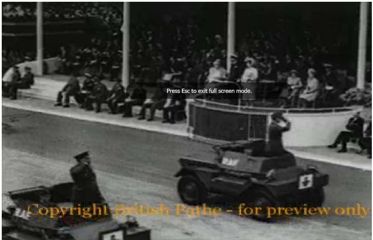
Daimler scout cars with officers from The Royal Air Force