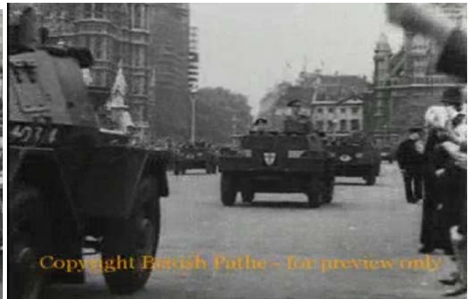
Daimler scout car F340314