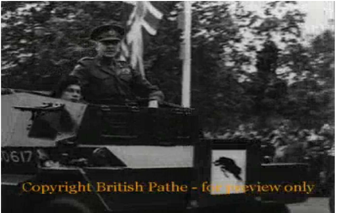
Daimler scout car F340617 with officer from XXX Corps