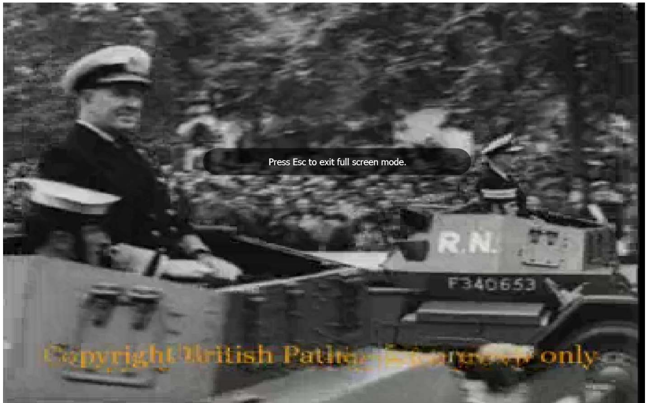
Daimler scout car F340653 with Naval commanders driven by naval ratings - Admiral Sir John Cunningham (no relation to ABC), C-in-C Mediterranean and Admiral Sir Geoffrey Layton of The Royal Navy