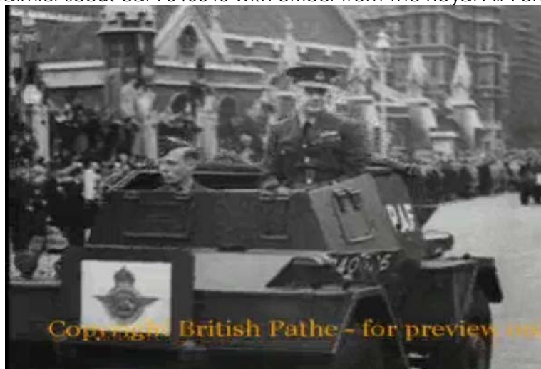
Daimler scout car F340617 with officer from The Royal Air Force