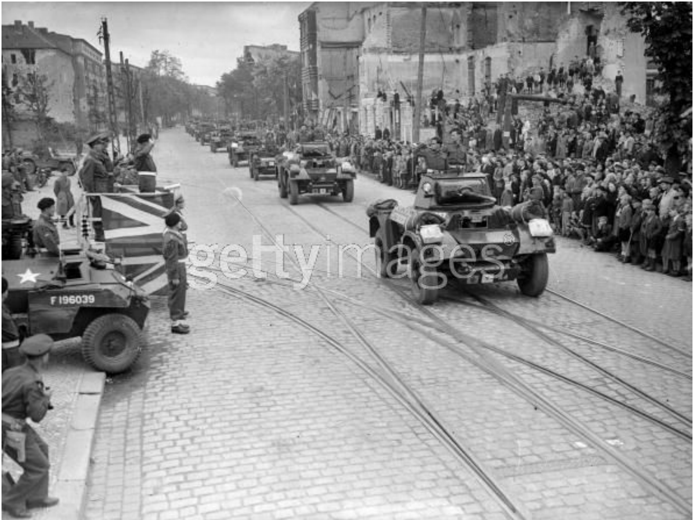
Description: Reputedly the Berlin parade of the 11 th Hussars