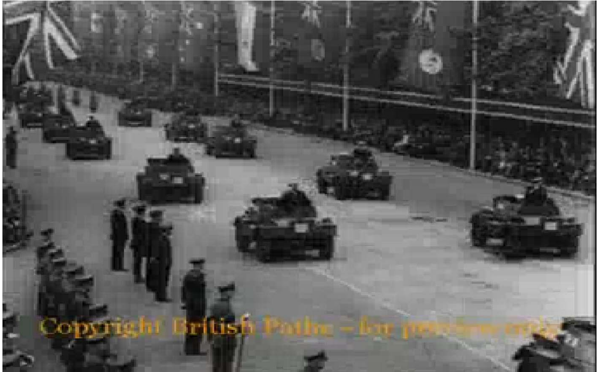
Daimler scout cars progress along the Mall

The London Victory Parade of 1946 was a British victory parade held after the defeat of Nazi Germany and Japan in World War II. It took place on June 8, 1946. The celebration mainly encompassing a military parade starting at three points which converged at the city. The march then proceeded to the Mall where each regiment and service passed the saluting base.